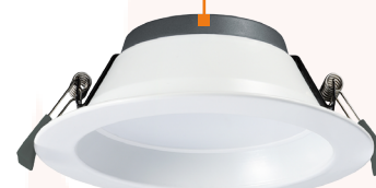
Downlight 20cm 20W