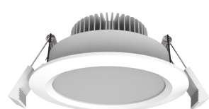
Downlight 10cm 9W