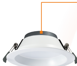
Downlight 14cm 18W